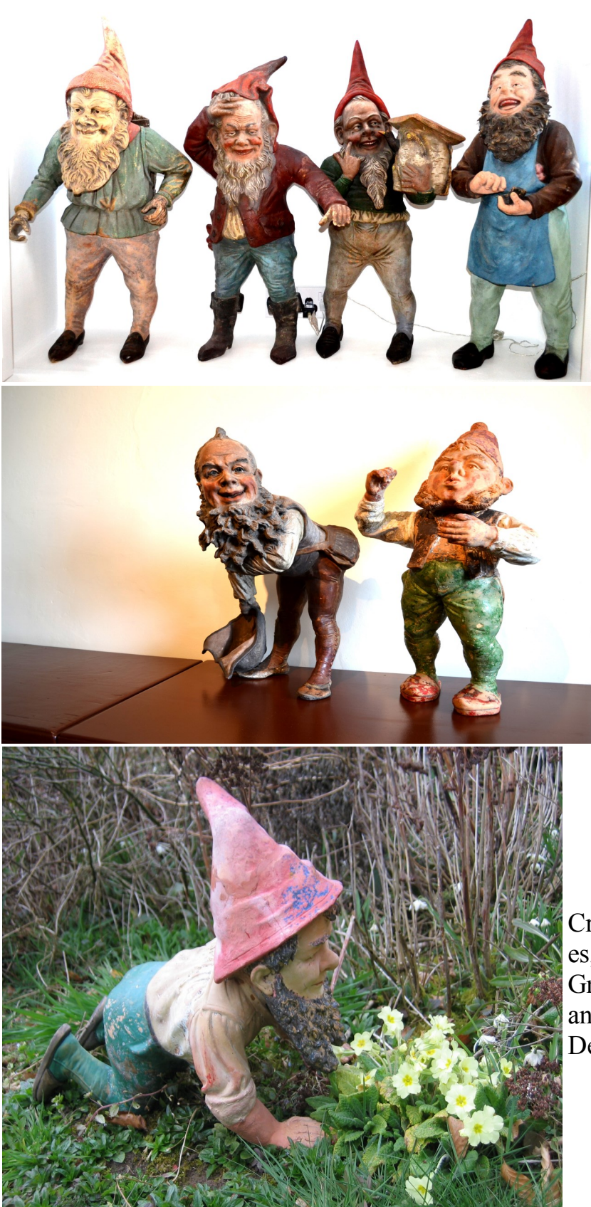
Four Paul Kenenan Gnomes from The Gnome Reserve Museum of antique Gnomes. Photo by Joe Atkin.

The Courtier and Conductor. Photographed by Joe Atkin at The Gnome Reserve Museum of antique Gnomes.