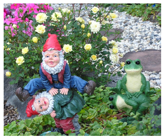
Playing Leapfrog with Frogs

Gnomes love to play games with each other as well as with other animal life. Every gnome garden should display a wide variety of these fun activities, as it truly depicts what a joyful bunch they are. They do not need a lot of expensive material objects to enjoy these carefree and relaxing pastimes.