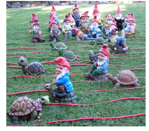
Turtle Races work best having gnomes as jockeys.

Gnomes love to play games with each other as well as with other animal life. Every gnome garden should display a wide variety of these fun activities, as it truly depicts what a joyful bunch they are. They do not need a lot of expensive material objects to enjoy these carefree and relaxing pastimes.